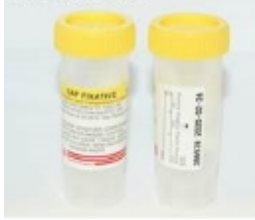
SAF Fixative Container